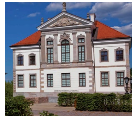
The Fryderyk Chopin Museum holding the world's largest collection of his memorabilia is the most important one.

Every five years, the International Fryderyk Chopin Piano Competitions organized here. 450 pianists from 45 countries signed up to participate in the 17th edition, which will be held in October 2015. The struggles of the competition can be followed around the world on a regular basis through live streaming video available at http://konkurs.chopin.pl , as well as on a specially prepared application for mobile devices.