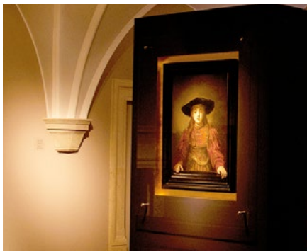
Rembrandt's painting Girl in a Picture Frame (1641), Rembrandt, part of the Royal Castle collection since 1994